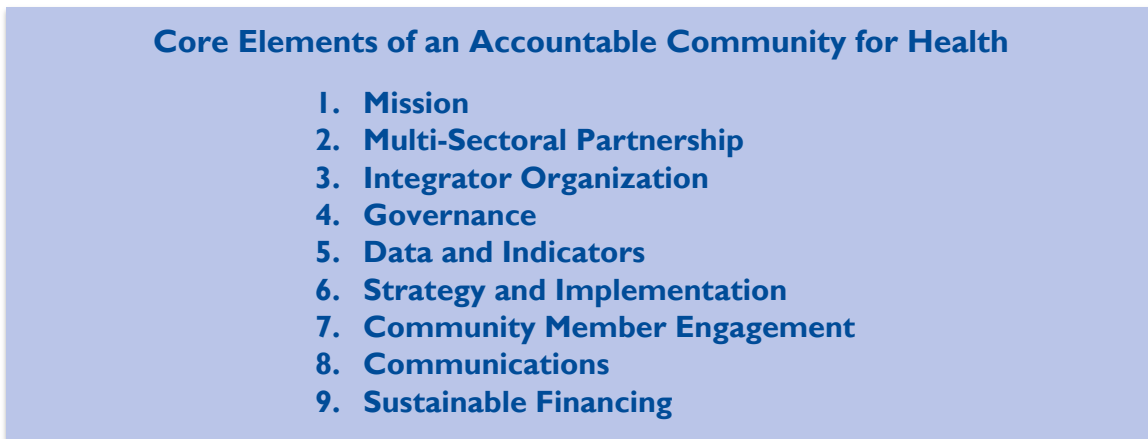
FIGURE 2. Core Elements of an ACH

Based on a review of national sites engaging in collaborative activities consistent with the ACH approach, Prevention Institute has identified nine core elements of the ACH model that support its successful development and implementation as illustrated in FIGURE 2. 20 The full incorporation of each of these elements is aspirational; the early work of an ACH can begin with only some of the elements in place.