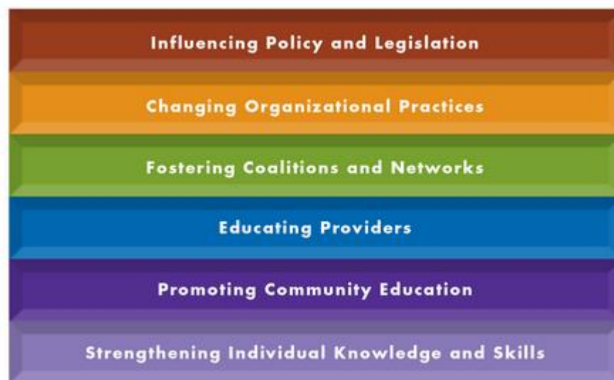
FIGURE 4. Spectrum of Prevention