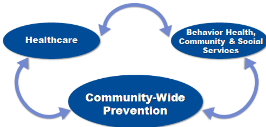
FIGURE 3. Accountable Communities for Health Multi-Sectoral Partnerships